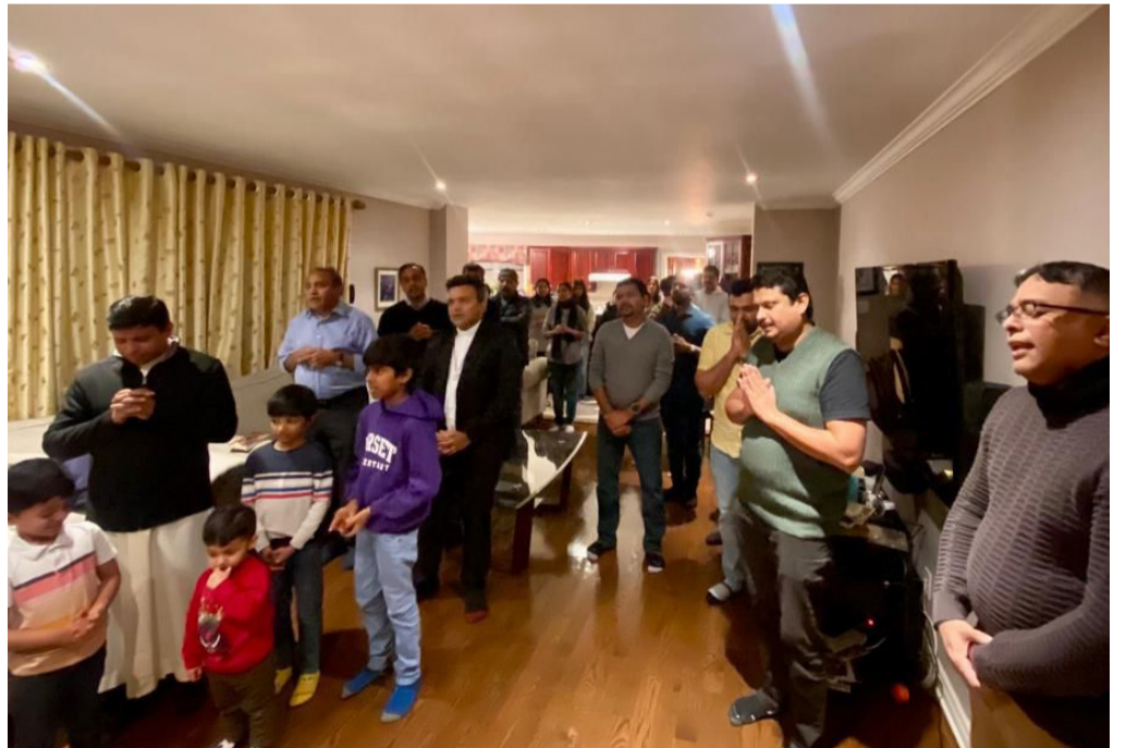
FAMILY UNIT PRAYER

Solemnity of Christ the King is celebrated on the last Sunday of the liturgical year every year. The feast of Christ the King was celebrated this year on the 20 th of November.