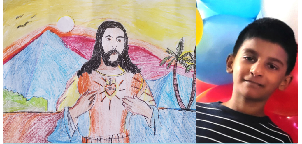
A Drawing by Aibel Joe Anoop