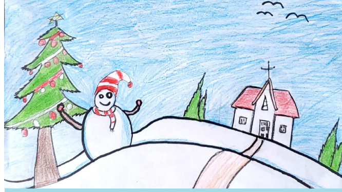
A Drawing by Aibel Joe Anoop