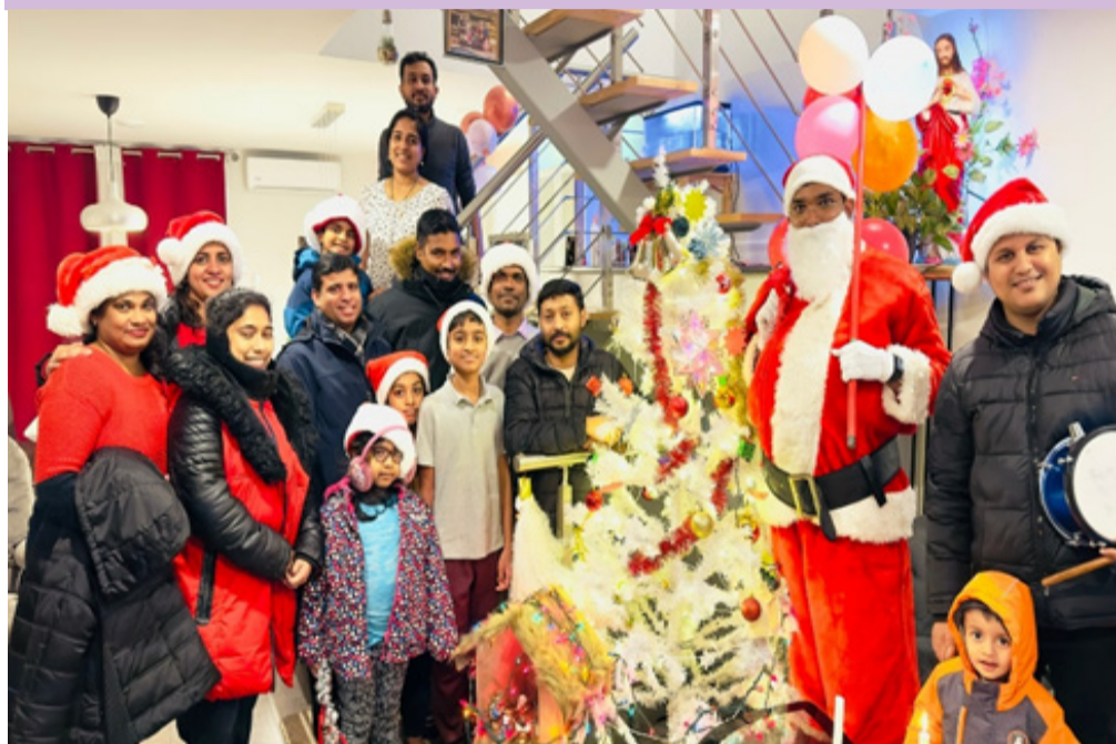
WEST ISLAND FAMILY UNIT CAROL ON 18 TH & 19 TH DECEMBER 2022