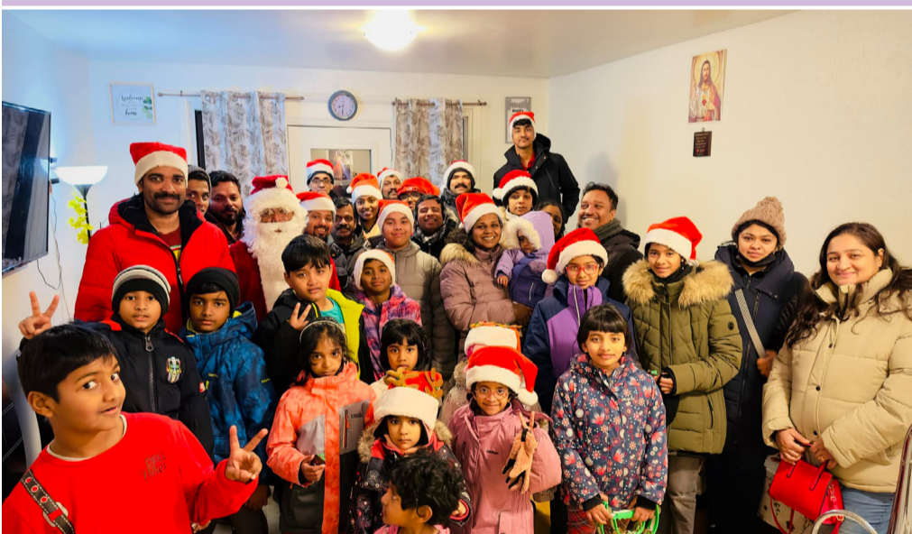
COTE VERTU FAMILY UNIT CAROL ON 16 TH DECEMBER 2022.