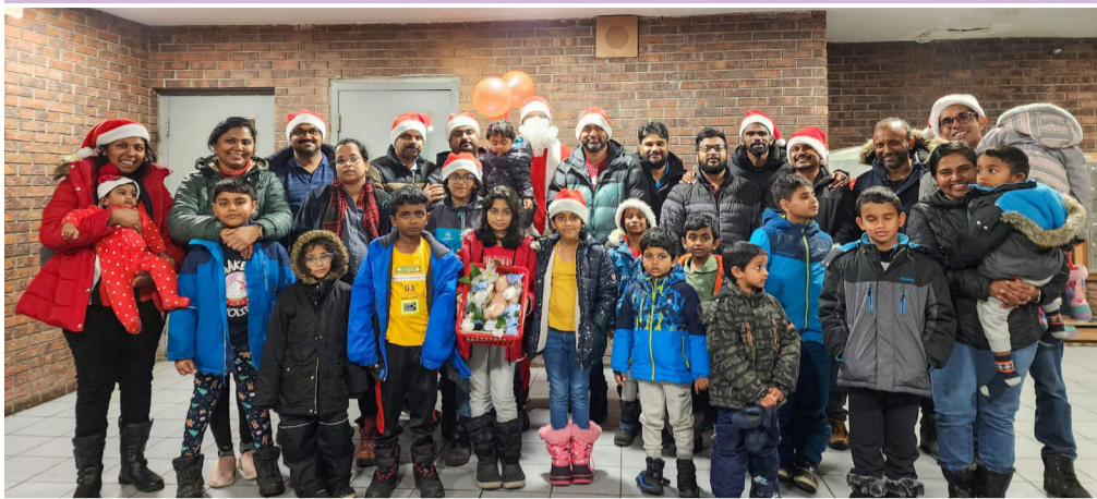
COTE SAINT LUC FAMILY UNIT CAROL ON 18 TH DECEMBER 2022.