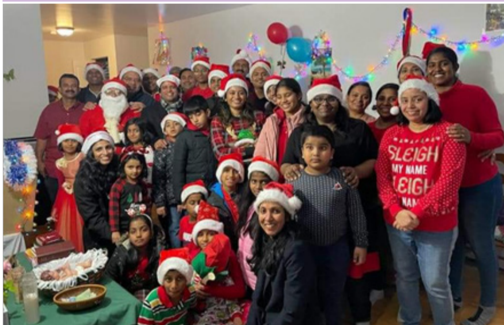
ST CATHERINE AND VANHORN FAMILY UNIT CAROL ON 10 TH DECEMBER 2022