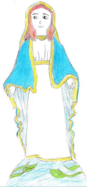
A Drawing by Tesslin Ann Pious