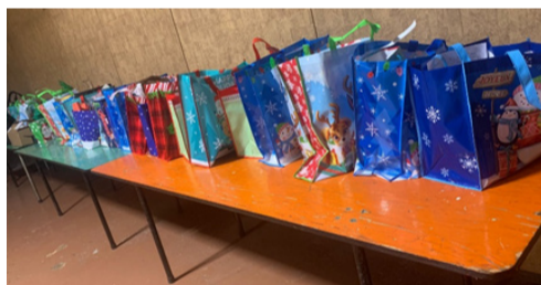
CHRISTMAS RAFFLE AFTER THE HOLY MASS ON 25TH DECEMBER.