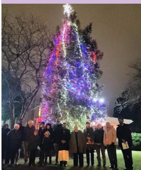
St. Richard and St. Joseph parish communities lit up the Christmas tree on November 27,2022.